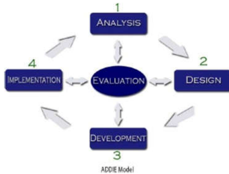
Figure 2. ADDIE Method Development

The procedure for developing the online training materials using the ADDIE development model consists of five stages, but is limited to the fourth stage of implementation which is divided into the following stages: